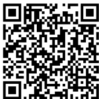
TABLE ORDERING AVAILABLE... Scan to order