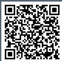
TABLE ORDERING AVAILABLE... Scan to order